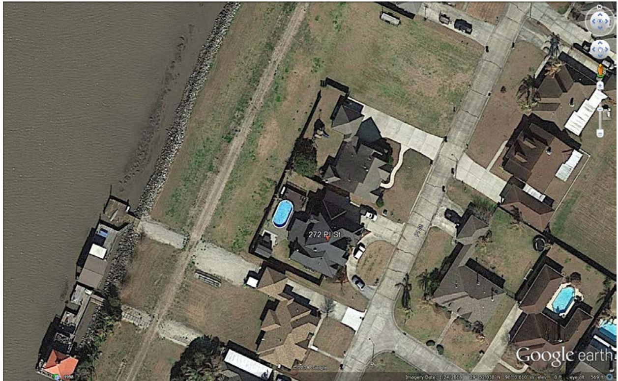
Figure 2: Aerial View